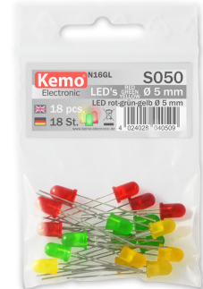
LEDs red-green-yellow Ø 5mm, approx. 18 pieces